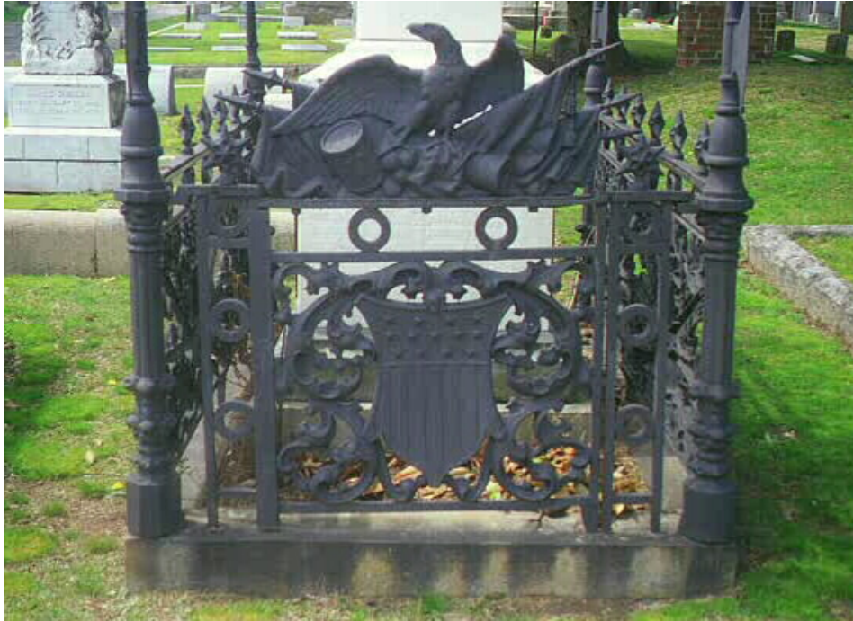
The front of the wrought iron enclosure with a shield and eagle.

On the sides and back of the enclosure were depicted a cockaded shako, sabers in their scabbards crossed with a musket, a powder horn and belt with a flint and bullet pouch.