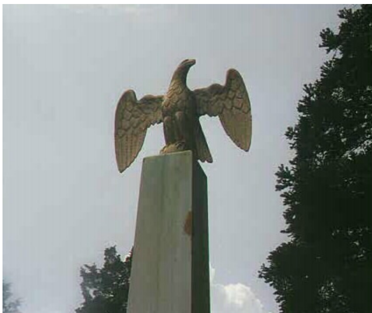
The eagle atop the monument. This is not the original eagle, which is now secured in the cemetery reception center after being recovered from thieves

The gold American eagle at the top of the monument lost its right wing when it was hit by a Union artillery shell during the siege of Petersburg. The damage was repaired, however it was done crudely with a steel plate. In 1956 the Cockade City Garden Club repaired and refurbished the 100 year old monument as a beautification project to restore the older portion of the Blandford Cemetery. The work focused primarily on the restoration of the wrought iron fence and gold eagle. Several of the 17 stars on the fence had broken off and were replaced, and the fence was generally repaired and repainted. The eagle was restored and the steel plate holding the wing together was removed because it caused a constant dripping of iron rust on the marble shaft and base which not only scarred the appearance, but created excessive erosion of the marble. The wing was reattached by welding. In addition, the gold leaf was recoated; bringing back brilliance to the sculpture that drew the attention of thieves who stole the eagle for a time. After the eagle was discovered and recovered from an area antique shop, it was placed in the Old Blandford Church reception center and a replacement eagle donated by the cemetery foundation now resides on top of the monument.