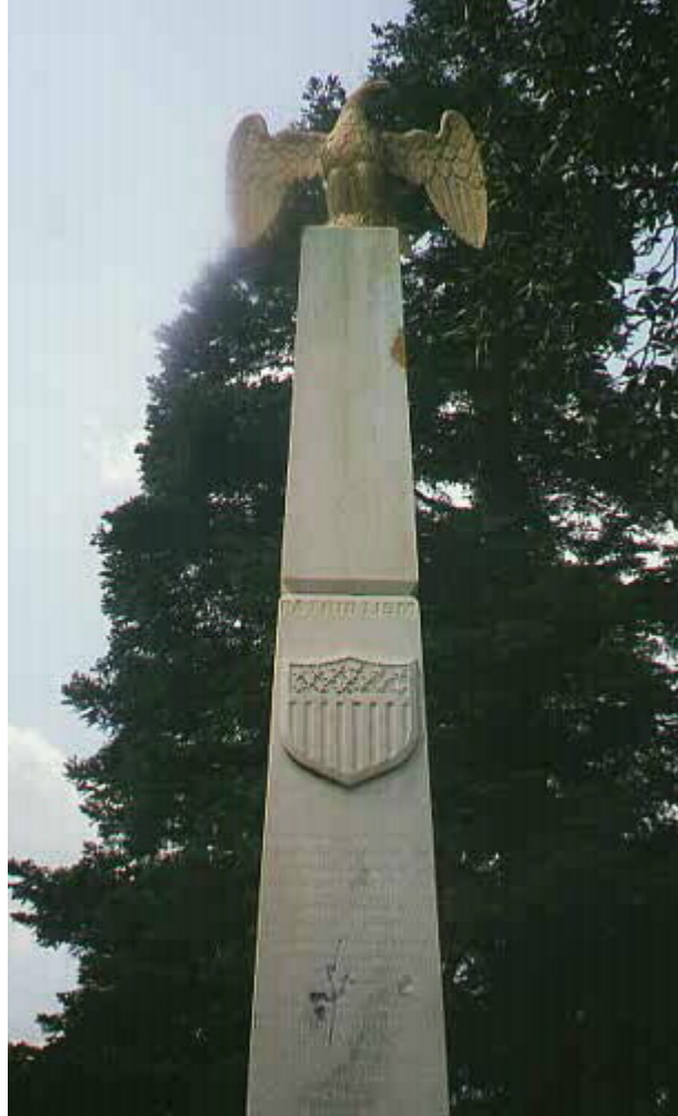
The front of the obelisk. The inscriptions have faded some but are still legible

On the back of the obelisk, underneath the erection date, is the epitaph for McRae that is simply: