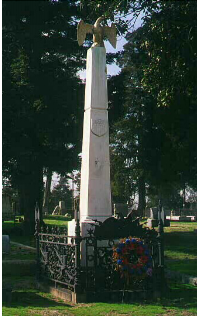
The monument to the Petersburg Volunteers as it stands in Blandford Church Cemetery today.

The monument was covered with inscriptions on every face of the obelisk and base or “die.” Today, much of these have eroded and faded, especially on the more exposed obelisk. On the front face was a national shield with 17 stars and the word “Patriotism” placed above the shield. Below the shield is the following inscription: 33