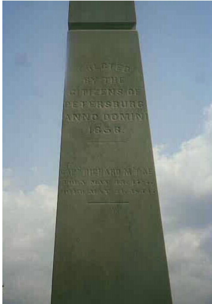
The back of the obelisk. The date 1856 is incorrect. The monument was actually erected in January 1857.

The base of the monument has inscriptions on all four sides. On the front is inscribed the following: