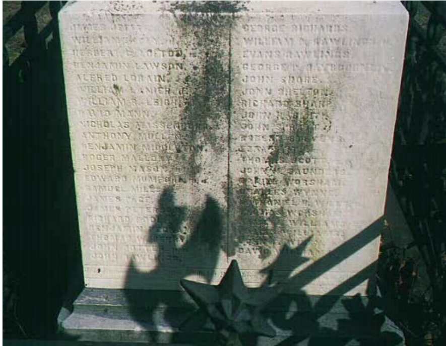
The back of the base showing the inscription of the names of the men of the company

to circumstances of their service; d – died, w – wounded at Ft. Meigs, k – killed at Ft. Meigs, p – promoted, and p.a – promoted in the Army.