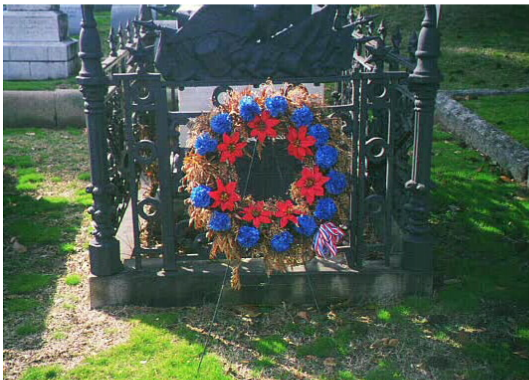
This wreath is a remnant of the 250 th Anniversary celebration of Petersburg and indicates the monument is still included and remembered during local celebrations.

Petersburg has used the legacy of the Volunteers, the monument and the famous sobriquet through the years in various local celebrations and commemorations. An example was the “Cradle of the Cockade Homecoming Week” in June 1957 where the Petersburg Volunteers were remembered in a local history pageant. Most recently, the City of Petersburg celebrated its 250 th Anniversary, holding a commemoration that placed a wreath at the monument on December 17, 1998. A short article about the monument also appeared in the local newspaper supplement for the celebration, ensuring the War of 1812 was not forgotten at least in this community.