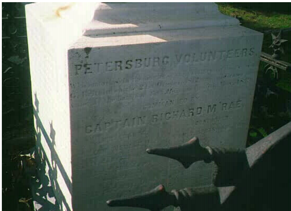
The front of the base inscribed with text and the names of the company officers, noncommissioned officers and musicians.

The names of all the soldiers of the company were placed on the right and back sides of the base. An initial following a name indicates a change in status due