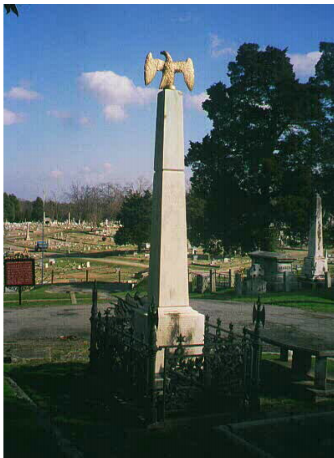
The monument from the rear looking out over the cemetery toward the scene of the fighting during the Civil War

A visitor to the monument today can not fail to be struck by the irony that this commemoration, which appears to ooze patriotism for the United States, could have been erected under the ominous clouds of a divisive civil war only four years away. Even more ironic is the fact that were it not for the Civil War and the siege of Petersburg, the monument to the Volunteers would perhaps be hidden deeper from the eyes of generations of citizens. It was the gaze of those eyes that prompted General Harrison to proclaim in his General Order prior to the battle at Ft. Meigs, "To your posts then fellow soldiers and remember that the eyes of your country are upon you." The monument to the Petersburg Volunteers embodies Harrison's exhortation and with proper care and preservation, it will continue to honor the history of one of the most effective combat units that fought in the War of 1812.